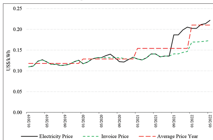
Figure 3: The behavior of the price of electricity in the department of Atlántico

first corresponds to the mechanism where spot energy is traded between generators and marketers. In contrast, the second option is an agreement between two parties where are agreed upon terms such as quantity, price, and electricity delivery conditions. On the other hand, self-generation has been considered since Law 143 of 1994 and Law 1715 of 2014, which favored the connection of On-Grid photovoltaic systems by residential users.