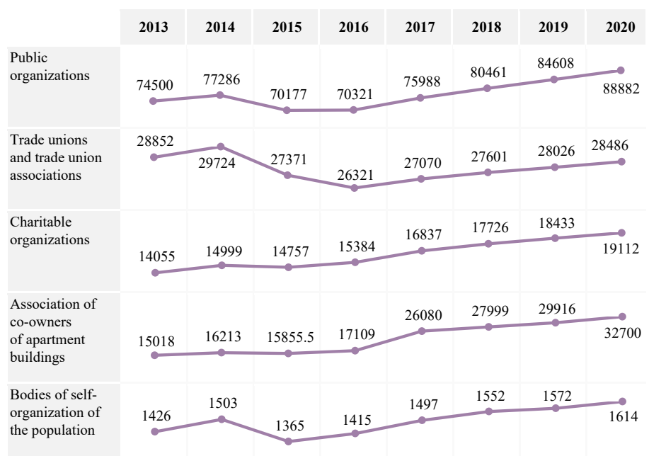
Fig. 1. Growth dynamics of the number of registered public associations by organizational and legal forms in Ukraine by year (modified from [2, 13, 14])

From Fig. 1 it is evident that the number of SCOs has increased in Ukrainian society since 2016, which confirms the need to develop and implement a quality management system.