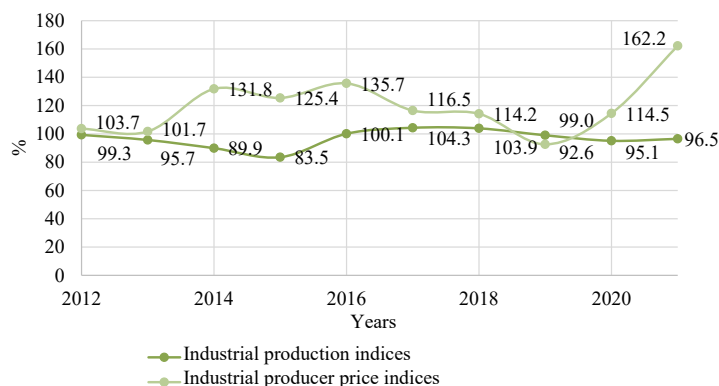
Fig. 1. Dynamics of industrial production indices and producer prices in 2012–2021, % (compiled according to [9])

Some industries have increased output, in particular: the production of basic pharmaceutical products and preparations (by 240 %); manufacture of wood and paper products (by 193.5 %) (Fig. 1).