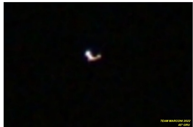
Fig. 1. Plasma in the atmosphere appeared at 11:49 p.m.

3.2. Anomalous light phenomenon, Berceto (Italy) July 15, 2022 – 11:49 p.m. Local Time. Still at the same monitoring location, at 11:22 p.m. (Local Time) the ELF receiver recorded a very faint peak between 1 Hz and 4 Hz. A few minutes later, at 11:49 p.m. (Local Time) also in the same area, along the side of the mountain ridge, a very intense light phenomenon suddenly appeared, moving from left to right and changing shape (Fig. 1). Two photographs were taken in succession with a Fujifinepix S3Pro digital camera with a shutter speed of 0.5 sec at ISO 1600, zoom to 70 mm, f 4.0, recording the change in shape and brightness of the phenomenon itself. Observing the luminous phenomenon at magnification, it can be seen that initially it appeared as if it consisted of two luminous cores, while in the second photo the two cores appear to have merged together, changing completely in shape with change in brightness as well. Astrometric analysis, in false colors, confirmed the change in brightness and shape of the light phenomenon, showing the presence of two initial bright «cores» that later merged together, changing their profile. The Point Spread Function (PSF) of the distribution of photons of light in 3D and photometry show that the phenomenon emitted light of its own and as if it was within contained in a kind of energy «bubble», such that it confined the light itself.