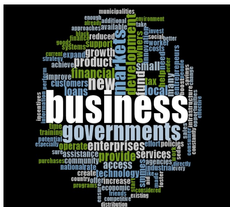
Fig. 3. Word cloud exhibiting growth and development strategies for SMMEs in the 4IR

This was an important theme as it dealt with the strategies and support required to drive firm performance and development in the unstable corporate climate. In terms of government support, funding was the highest ranked factor. Funding was the core of attaining sustainability from the start for small businesses. Small businesses always had difficulties in terms of finance and capital and trying to adhere to the 4IR required substantial investment [22]. New products and services also required research and development as well as escalating production costs [20]. Therefore, more funding opportunities must be provided by government.