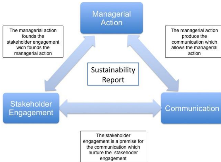
Figure 1. The relationships between managerial actions, communication processes and stakeholder engagement (Gazzola & Colombo, 2013)

Thus the sustainability report must be a valid instrument that stimulates and heightens the awareness of management in responsibly pursuing an effective social role to continually improve nonprofit organization performance (Manetti & Toccafondi, 2014). Drafting a sustainability report means joining the pursuit of the mission with the collective interest; it is an index of progress on the communications front as well. The sustainability report must express and harmoniously reconcile the economic measures and the quality of the relationship between the organization and its stakeholders, represented by the collectivity (Vlad, 2012).