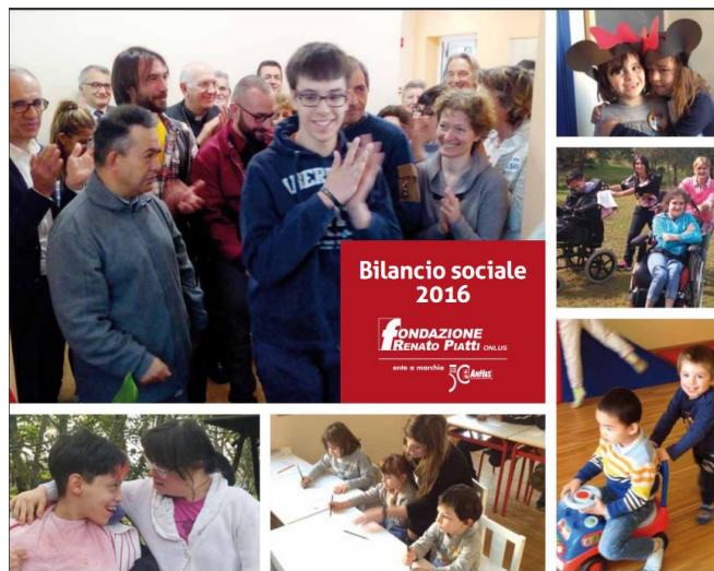
Figure 3. Cover of the Social Report 2016 Fondazione Renato Piatti Onlus

It is evident, therefore, that an organization of this size have the need and the requirement to have also a tool able to make more clear and transparent to its stakeholders that is able to do, every day, for people with intellectual and relational disabilities. Then, starting in 2008, the governing bodies of the Fondazione Piatti, have decided to take the experience of the construction of a Mission report for 2008, which is useful to start a growth path that would lead, in 2010, to develop the first document of sustainability reporting for 2009 (Figure 2); from then on, have been prepared the financial statements of the following years, introducing each time more information and making necessary changes, useful to achieve the goal of building a tool capable of reporting comprehensively on all activities of the organization and respond in full to the information needs of all stakeholders (Figure 3), Although it is not forced by law (in 2016 it had 335 employees and a total staff of 478 units).