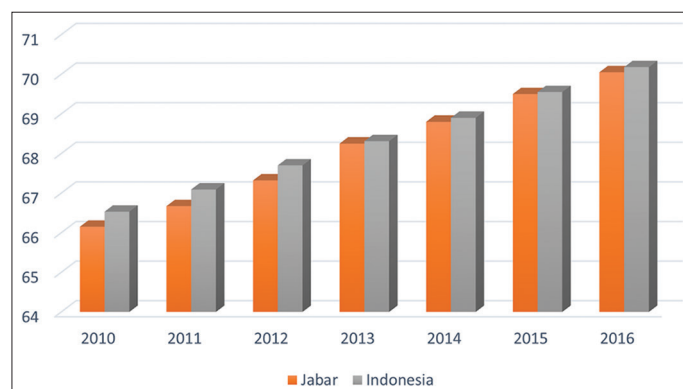
Graph 2. Human Development Index of West Java and Indonesia Year 2010 - 2016

Source: Statistic of Electricity year 2015, 2016, Directorate General of Electricity of Ministry of Energy and Mineral Resources, Electrification Ratio of West Java. (2006-2015), Word Data News and Research. Available from: http://www.databoks.katadata.co.id