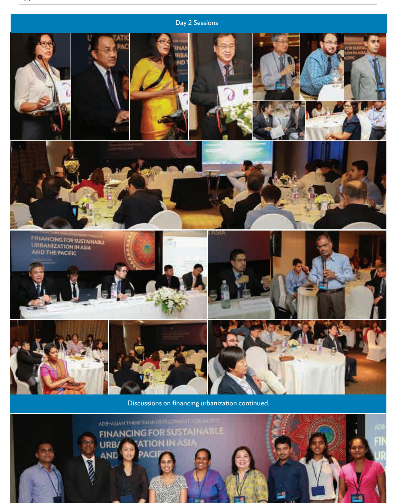
Forum Secretariat from Asian Development Bank and Institute of Policy Studies of Sri Lanka.