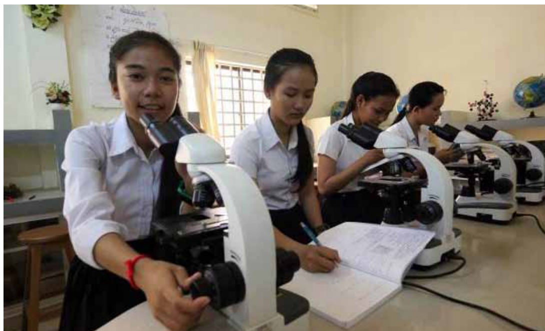
Science labs for better learning. Now equipped with microscopes, students examine specimens at a science laboratory in one of the 18 upper secondary resource centers upgraded under the Enhancing Education Quality Project.

In a science lab of an ADB-financed resource center in Hun Sen Chum Pu Vorn Secondary School, Phnom Penh, 15 students gather to practice biology case studies. The lab, equipped with tools such as microscopes, human skeleton models, telescopes, pendulums, and globes, caters to students from grades 9 to 12.