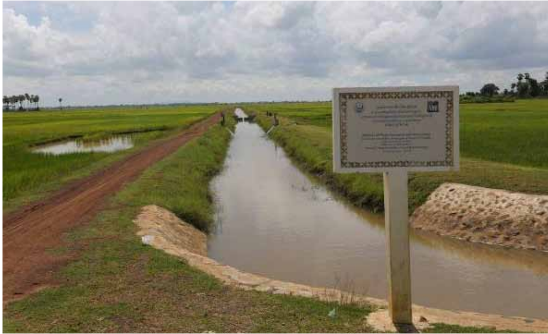
Improved agricultural yields. Upgrading the Boeng Khang Tboung Secondary Canal of the Tonle Sap Lowlands Rural Development Project has improved agricultural yields.

Since 2013, however, the productivity of paddy cultivation has more than doubled, yielding 875 tons of rice per season. Despite working in the wet-rice fields on a hot and sunny day, farmers rejoice in their daily toil, knowing that the first rice harvest has ended and the rainy season is approaching, which signals the start of Cambodia's main rice-planting season.