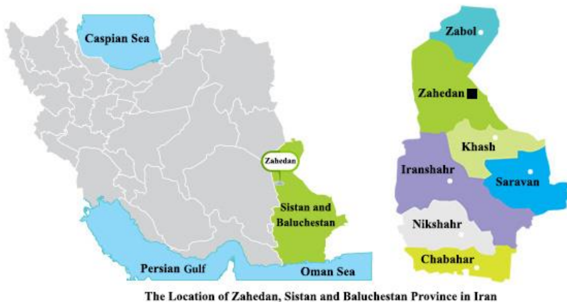
Map1. The location of Zahedan, Sistan and Balouchestan Province, Iran