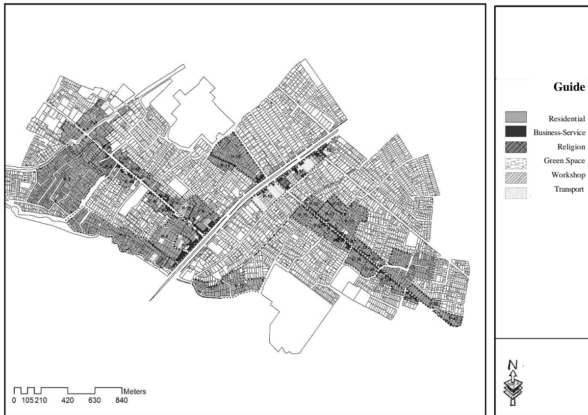
Map 2- the position of land use in extremely distressed blocks needing urban regeneration