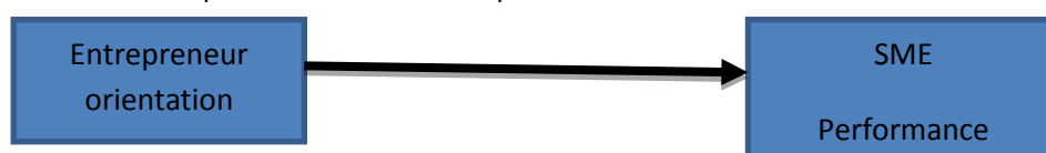
Figure 1. Conceptual Model

H1: there will be a positive relationship between EO and SME performance.