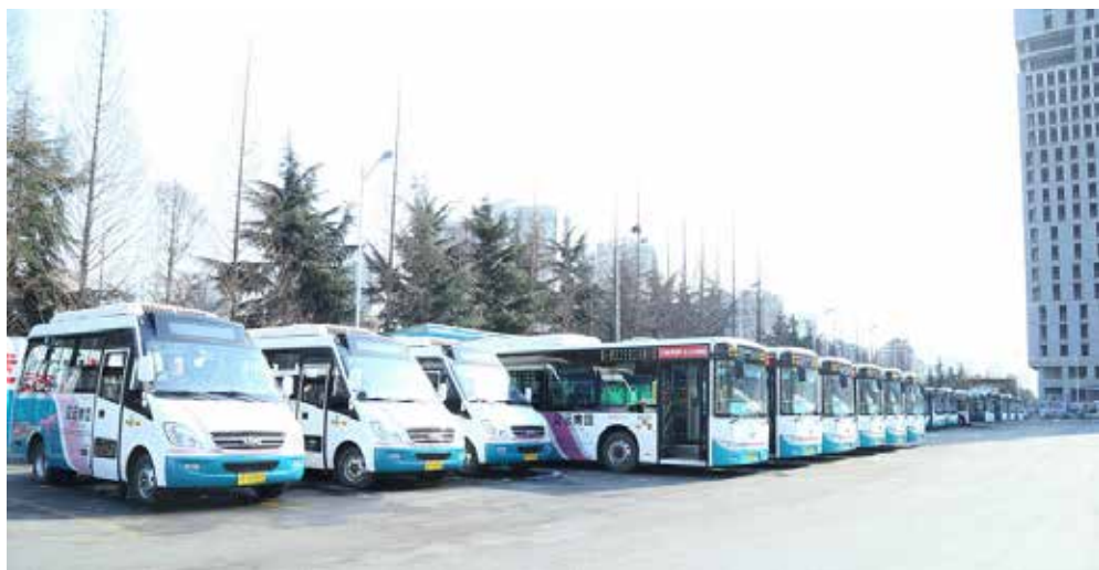
Environment-friendly transport. Jowin Group’s clean bus fleet at Qingdao East Bus Terminal.

“We charge the vehicles during off-peak hours when the cost of electricity is lower to keep costs down,” explains Cao Chunguang, head of the Technical Equipment Department of the corporation.