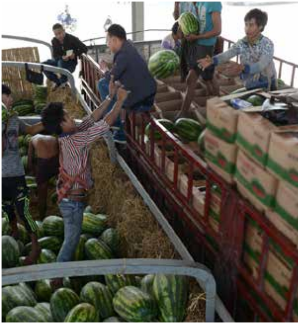
Just in time. Fruits and produce arrive at the market in good condition due to faster travel times.

“These projects not only drive local development, but also bring job opportunities to local and Myanmar people and increase their incomes. The road also facilitates the development of surrounding countries, enabling them to benefit from the fast economic growth of the People’s Republic of China,” he states.