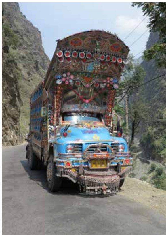
Crucial to business. The Naran road leads to popular tourist spots and markets.