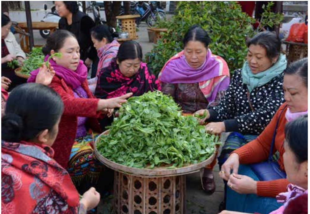
A united community. Dai people prepare for a wedding banquet at the Bodhi Temple in Mangshi City (photo by Lu Jingwen).