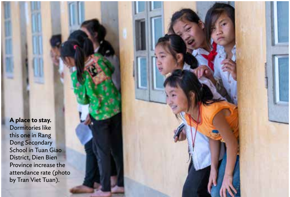
A place to stay. Dormitories like this one in Rang Dong Secondary School in Tuan Giao District, Dien Bien Province increase the attendance rate.

Education and training, which can lift many of them out of poverty over the long term, are a constant struggle. For many of these students, school is out of reach due to poor roads, long distances from populated areas, and language and cultural barriers. Ethnic minority children, particularly girls, are often