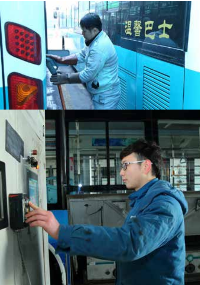
Bus charging. A staff member powers up a bus at the electric recharge station of Jowin Group located at the East Bus Terminal (top). An operator at Jowin Group's bus battery swap station (bottom).