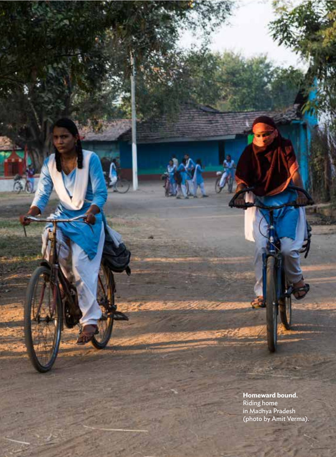
Homeward bound. Riding home in Madhya Pradesh.