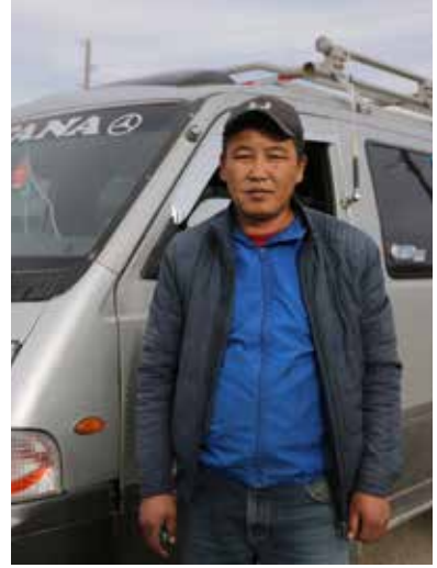
More savings. Tulga, who operates a shuttle service to Khovd city, saves time and fuel by using the new road.

With the improved roads, doctors in the province can see more patients over a wider geographic area, which is crucial in the vast, sparsely populated rural areas of Mongolia.