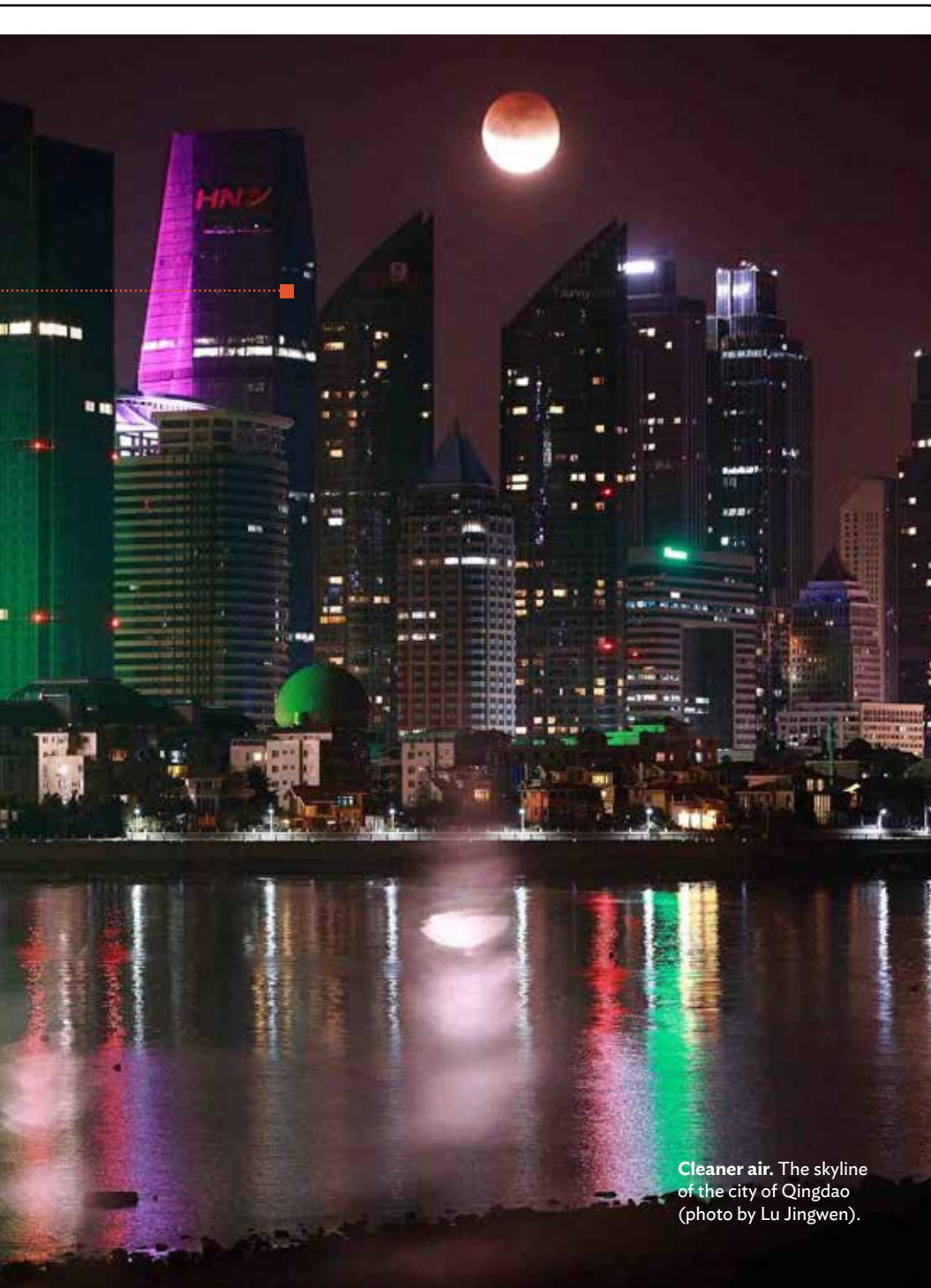
Cleaner air. The skyline of the city of Qingdao.