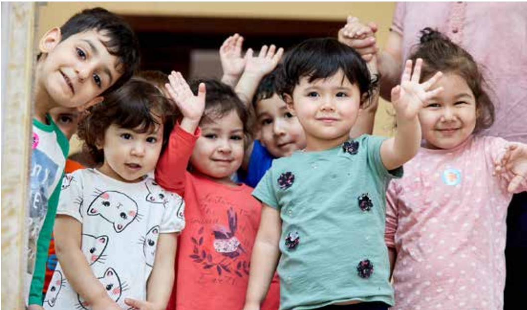
Next generation. Children at a Tashkent pre-school share smiles as they wave to the camera.