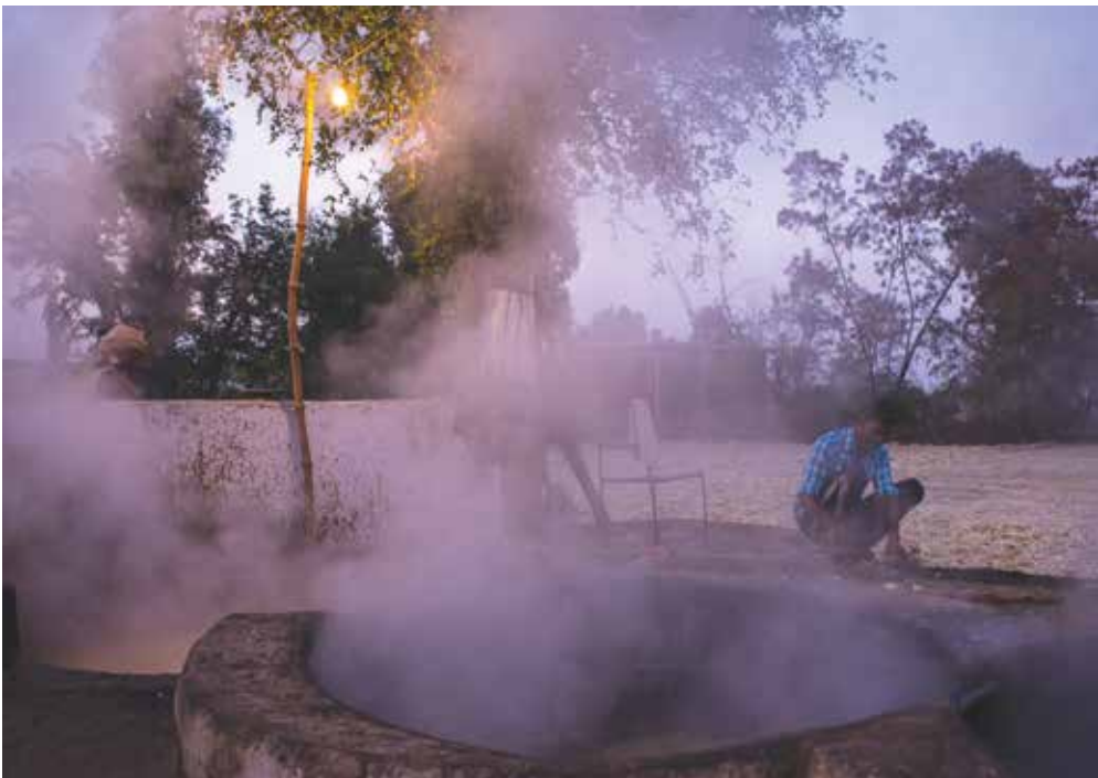
Sweet results. Jaggery made at farms like Moolchand Malviya's is sold in nearby markets.