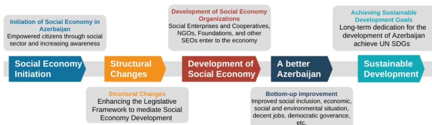
Diagram 2: Development of Social Economy and Achievement of Sustainable Development

The road to attain sustainable development is explained in 5 steps, but there need to be more attentive strategies at each step in order to achieve the goal. It is important to keep in mind that these steps must be taken through the commitments of all three sectors working in partnership, otherwise, it will take too much time for civil society to reach them on its own, due to legislative, financial, operational and other constraints. The present situation in regard to the SE damages the existing development mechanisms of the country and impedes further improvement of the sector. Therefore, the country is in need for experts on the topic to facilitate the following development steps.