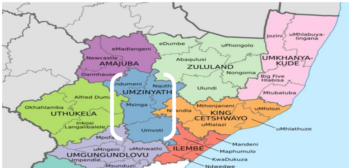
Figure 1. Map of KZN Province showing the Umzinyathi district municipality