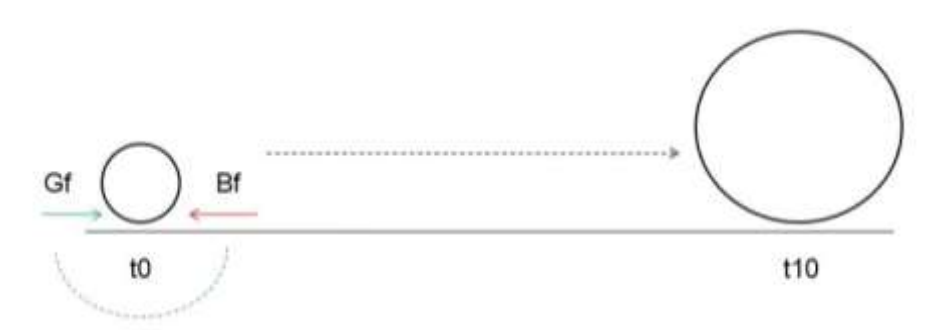
Figure 1. The snowball metaphor

As it has been depicted, one could see two snowballs: a smaller one standing for the present moment (t0) and a larger one standing for the future (t10). This means that when we start a communication process we have a weak relationship with our stakeholders, and we expect the relation to get stronger during the process, which logically requires time and trust.