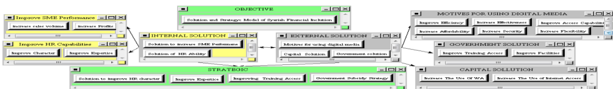
Figure 1: Detailed research model formed after the construction phase of the model

The above model explains that the purpose of the development of the model is to find effective solutions and strategies on the inclusion of Islamic finance by utilizing digital media for SMEs (case study of BMT partner MSEs in Deli Serdang Regency). There are 2 (two) main levels in this research model, namely the solution level and the strategy level. Solution level has two main sub criteria, namely internal and external solutions. Internal solutions have two sub criteria, namely MSEs performance and HR performance. External solutions have three main sub-criteria, namely motives for using digital media (BMT), BMT capital, and government. There are six (6) elements in the strategy cluster looking for an effective model of Islamic financial inclusion with the use of digital media for SMEs (case study of BMT partner MSEs in Deli Serdang District), namely, improving character, improving expertise, increasing training, and subsidizing facilities by the government.