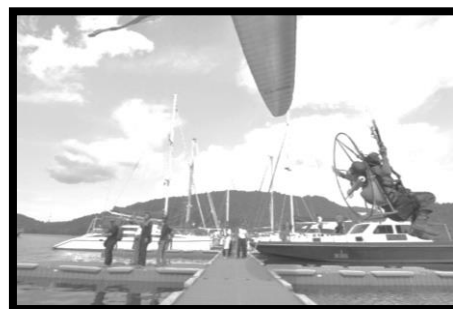
Pic 2: Marina Lhok Weng, Sabang

Yet from a geographical point of view, Sabang is very close to Phuket and Langkawi. The two main areas of sailing ship destination in the region. The distance from Sabang to Phuket is only 220 NM. While the distance of Sabang to Langkawi is only 260 NM. When the average speed of sailing vessels 10 NM per hour, then Sabang can be reached by the sailboats from Phuket just only 22 hours. But why is the number of sailboats coming to Sabang not as been expected? This paper aims to examine more deeply, why the visit of the sailing ship to Sabang is still relatively small, whereas the infrastructure built, promotion activities, as well as the geographical factor of Sabang, actually become strength factors to attract more sailors to visit Sabang.