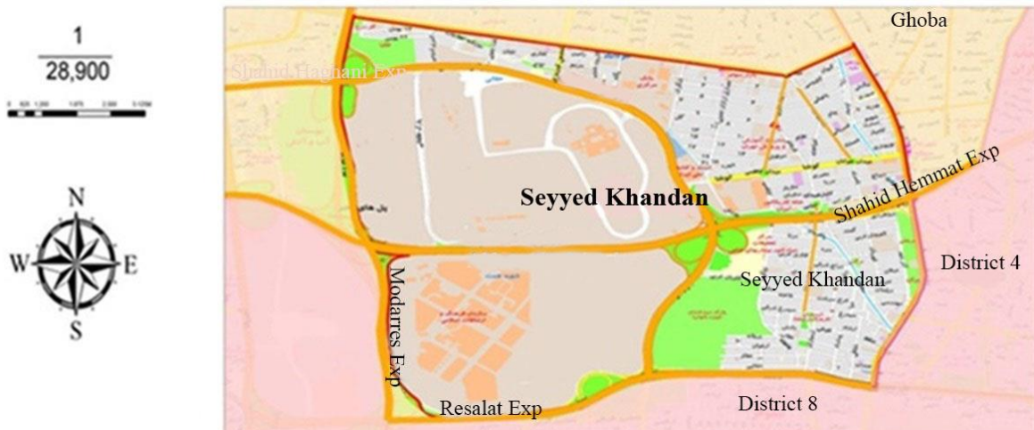
Map1. Studied area