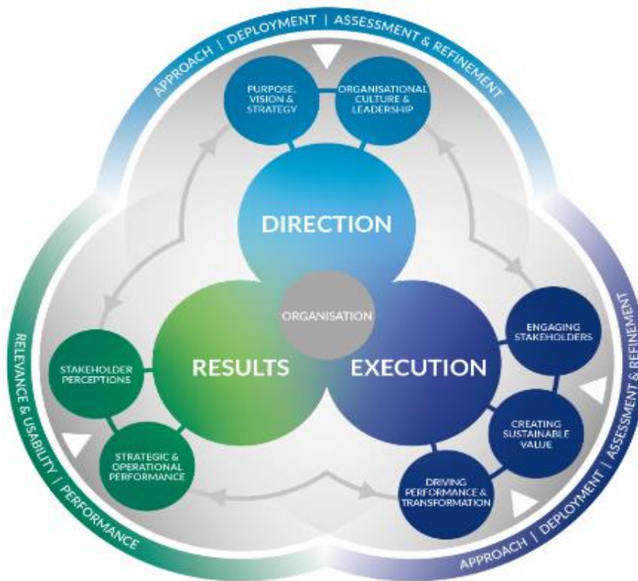
Figure 4. EFQM 2020 Model Diagram