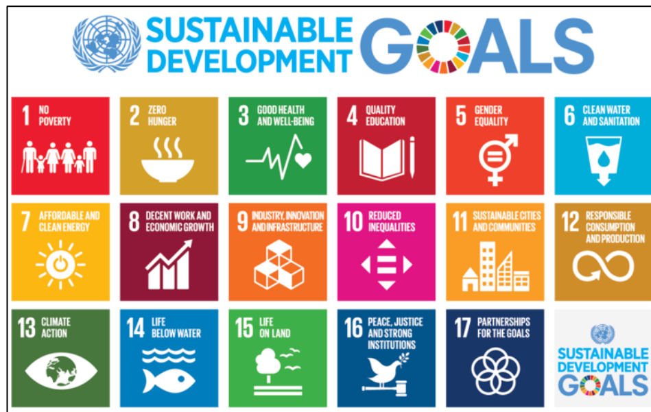
Figure 3. Sustainable Development Goals.