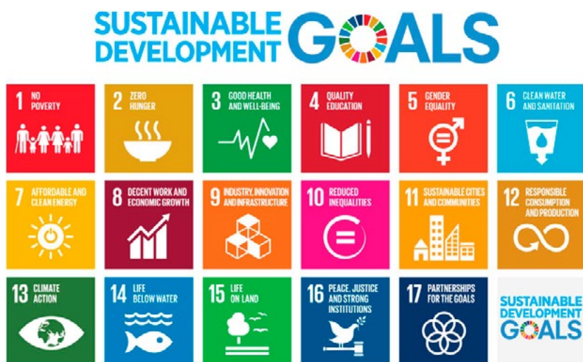
Figure 1 Sustainable Development Goals

The UNSDGs have been summarised by the UN as follows: