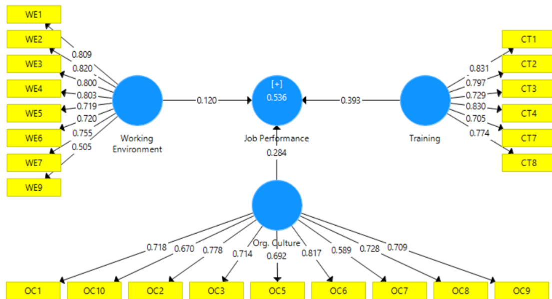
Figure 2. Structural Model