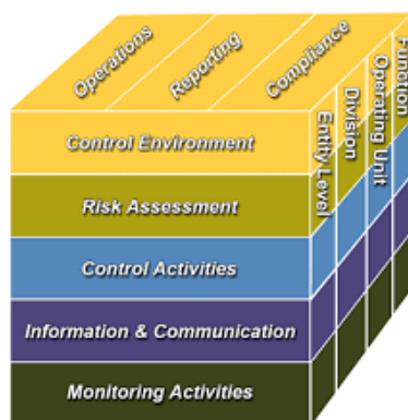
Figure 2. The COSO Integrated Internal Control Framework

In lay, internal control has to do with a logical sequence, as implemented by a business' management that can be used to mitigate risks to provide reasonable assurance surrounding the achievement of the relevant business' objectives (IIA, 2009; Mensah, 2011, Frazer, 2012). One of the best manners in which internal control can be established in a business entity is through using internal control frameworks Gyebi and Quain, 2013; Ejoh and Ejom, 2014). Three of the most used internal control frameworks include the COSO Integrated Internal Control framework, the Criteria of Control (CoCo) framework and the CoBIT framework (CICA, 1995; Spira and Page, 2003; Debreceeny et al., 2003; Moeller, 2007; Tuttle and Vandervelde, 2007; Pfister, 2009; Bernroider and Ivanov, 2011). Out of these three internal control frameworks however, the COSO Integrated Internal Control framework is the most popular, as shown in Figure 2.