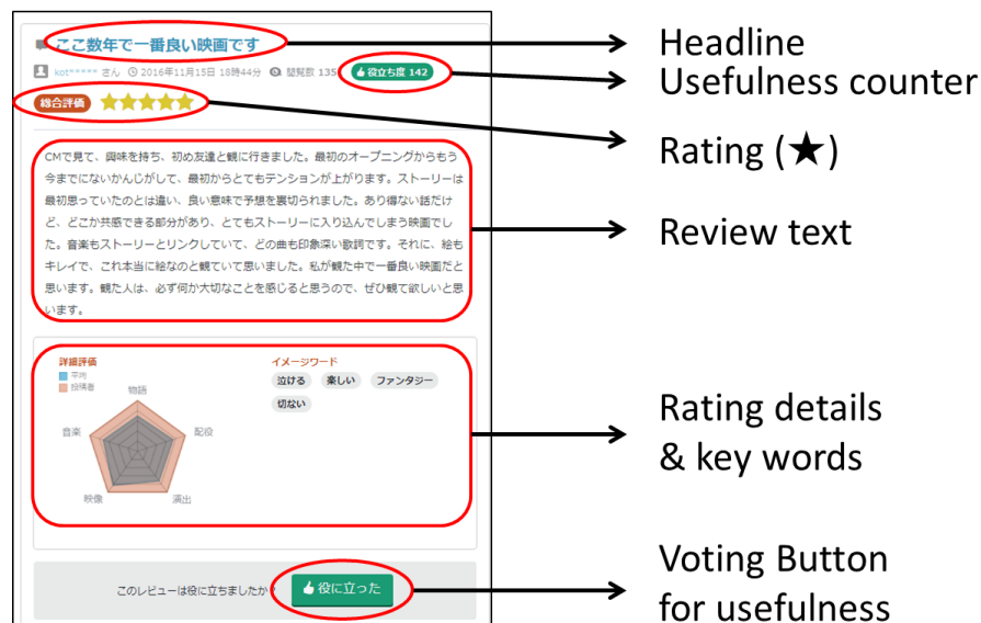
Figure 1. Review format of Yahoo! Japan Movies