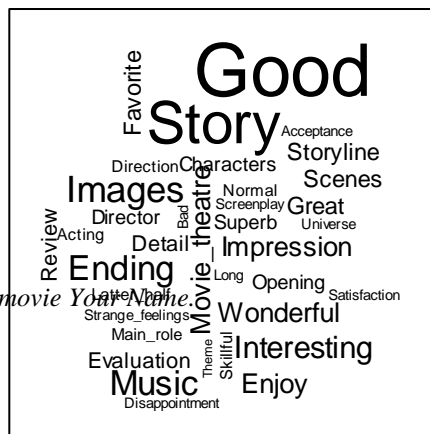
Figure 2 Word clouds for the movie Yoake Nabe