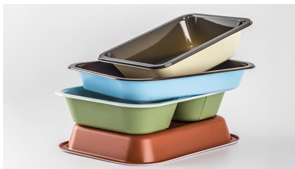
Fig. 1. Types of polymeric C-PET containers

PET packaging is one of the most popular types of packaging for various food products among manufacturers and consumers on the market. C-PET is a material with special components that ensure its heat resistance. This is a one-time durable package that competes with metal aluminum containers. Types of C-PET containers are presented in Fig. 1.