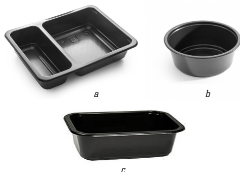
Fig. 2. Polymer C-PET packaging: a – two-section container of rectangular section; b – one-section container of round section; c – one-section container of rectangular section

The standard membrane-compensation method was used to measure the sealing strength of a container or its depressurization pressure, which occurs during sterilization due to thermal expansion of the product. The schematic diagram of the research stand is shown in Fig. 3.