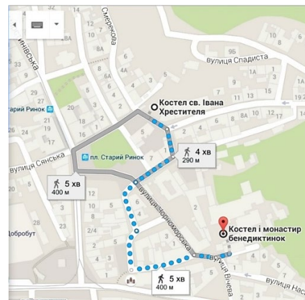
Fig. 3. Choosing a possible option for building a tour route between points x_1 and x_2

Thus, the attractiveness score of this route for the user is 280 points. This allows to compare different routes and determine which one may be more attractive to a given user, taking into account their preferences and other criteria (Fig. 3).