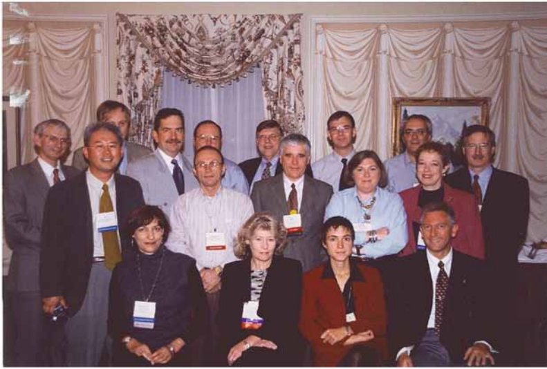
Fig. 1.7.1. The Founding Members of INORMS, 2001.