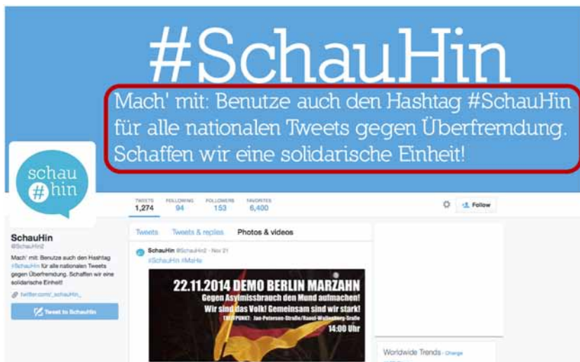
Fig. 3. SchauHin2 Twitter Profile Screenshot (Rectangle Added).

Importantly, while a Twitter handle must be unique, a Twitter name does not have to be. So, while the Twitter profile itself is @SchauHin2, the account’s owners call themselves SchauHin. Again, there is a conflation: the two profiles advocate effectively opposite views while having the same name and looking very similar. Hence, counter-actors used the feature of creating a profile to divert attention away and obscure the original #SchauHin campaign. As Fig. 3 shows, the SchauHin2 Twitter profile gathered a fair amount of attention and involvement – with over 150 followers, and more than 1,200 (re-)tweets with over 6,000 likes.