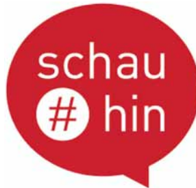
Fig. 2. Twitter Profile Picture.

When Twitter users create a profile, they create a kind of business card, brand, or biography of who they are and what is important to them. The organizers of the #SchauHin campaign created a profile for the movement to explain what the campaign was about, what its goals were, and how people could get involved and engaged. Using the same Twitter profile name and handle as the hashtag #SchauHin, organizers sought to create a "go-to" profile page to further increase visibility and recognition for the campaign. Fig. 2 shows the Twitter profile picture, which prominently features the hashtag.