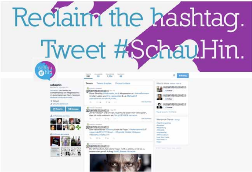
Fig. 5. #SchauHin Profile.

In the following months, the discursive struggle between supporters and counter-actors continued. As counter-actors ramped up their efforts to close and silence anti-racist discourse, #SchauHin organizers planned and then executed a campaign to “reclaim the hashtag” – encouraging Twitter users to again tweet more about their experiences of daily racism (cf. Fig. 5). Thus, the struggle for visibility continued.