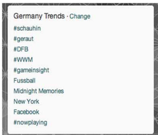
Fig. 4. #SchauHin as Trending Topic on Twitter.

Both Titanpad and Twitter were used to plan and execute the #SchauHin campaign. On both platforms, counter-actors who opposed the goal and efforts of drawing attention to everyday acts of racism tried to disrupt #SchauHin. On Titanpad, counter-actors and trolls were very effective in hindering coordination and planning. As soon as they gained access to the open platform, they were free to delete and edit relevant content, as well as add irrelevant, derogatory, or antagonistic content. Moreover, they could do this while remaining fairly anonymous. Such counter-efforts took on a different form on Twitter because of its different features. While counter-actors and trolls were also free to add content, Twitter’s features did not allow them to delete or edit content other than their own. In addition, Twitter allows for a clear attribution of content to specific accounts or Twitter handles. Despite this attribution, however, counter-actors have identified creative ways to mask it – such as, in our case, creating profiles that mirrored the actual #SchauHin account or posting tweets that mimicked aspects of the campaign’s content and styles of argumentation. As our case showed, the struggle between organizers/supporters and counter-actors played out quite differently on