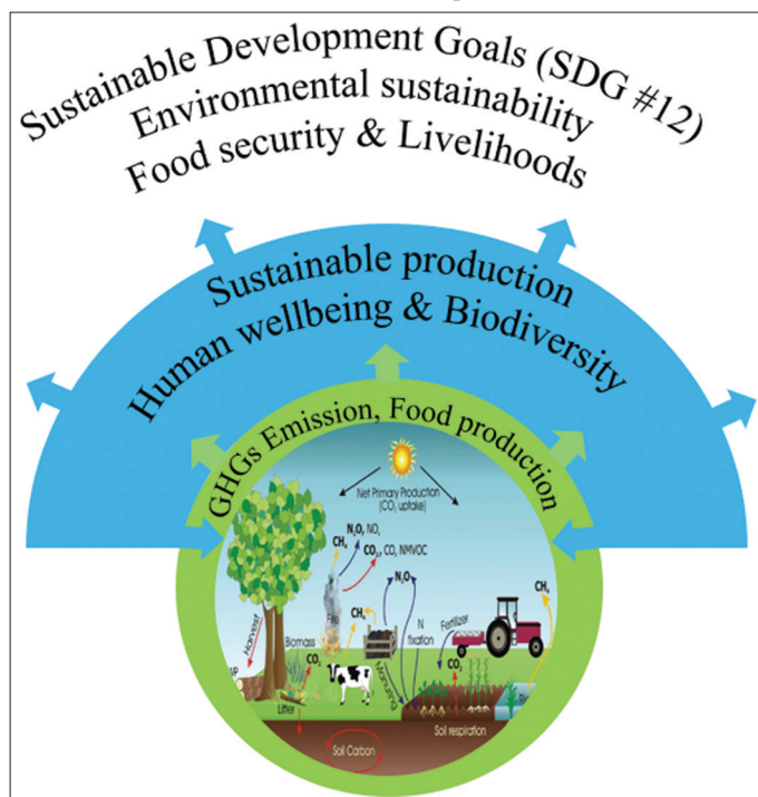
Figure 1: A schematic representation of GHGs, Food production and sustainable development