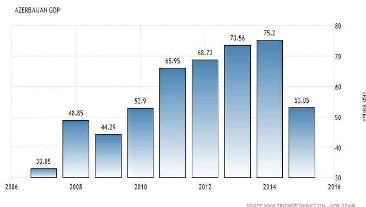
Figure 1. GDP of Azerbaijan (2005-2016), mil. USD

The increase in oil revenues led to an increase in budget expenditures. While 2005 budget expenditures were 2.1 billion manats, in 2015 were approved as 21 billion manats. So it has increased 10 times. In 2015, this figure was around 19 billion manats.