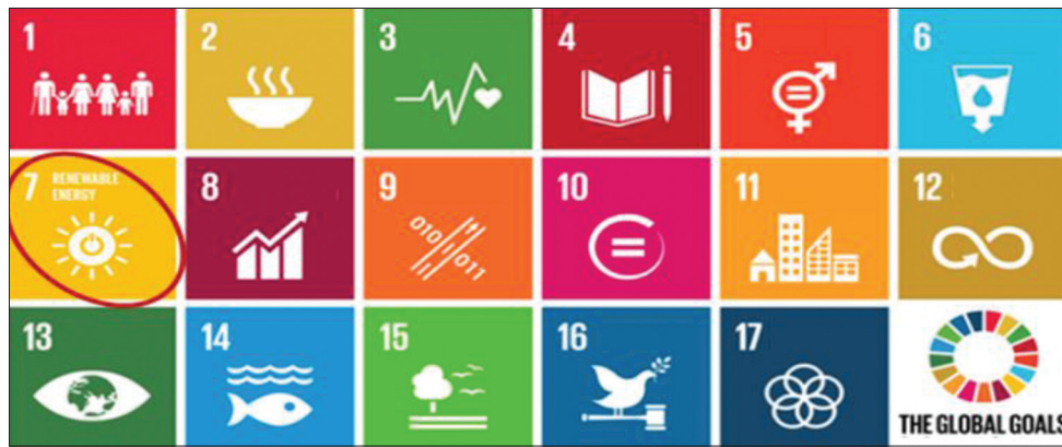
Figure 1: The 17 set goals of the United Nations SDGs (UN, 2015b)

According to World Energy Council (WEC), energy sustainability is a system of energy supply with three components - energy security, energy equity, and environmental sustainability that are interconnected. This tripodal relation is termed “energy trilemma” (Nentura; Tomei and Gent, 2015; Wyman, 2015).