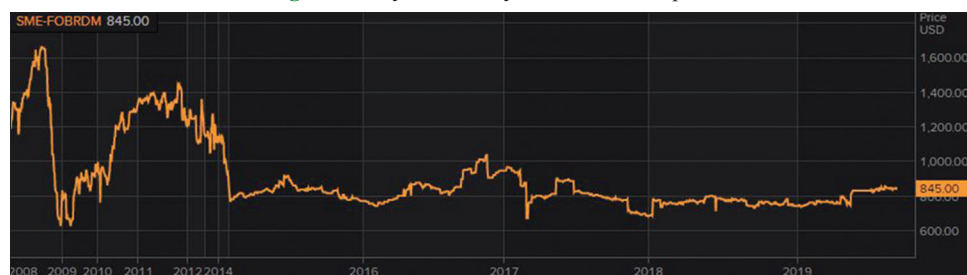
Figure 4: Soybean methyl ester biodiesel price