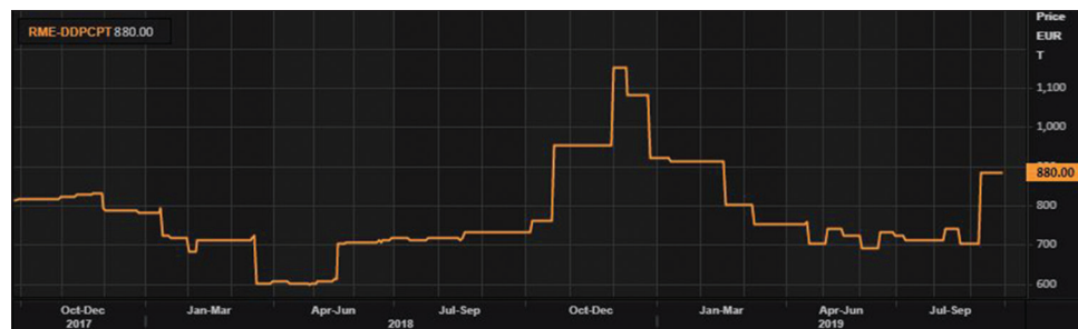
Figure 3: Rapeseed oil methyl ester biodiesel price