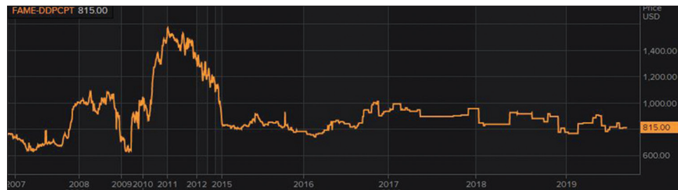
Figure 2: Fatty acid methyl ester biodiesel price