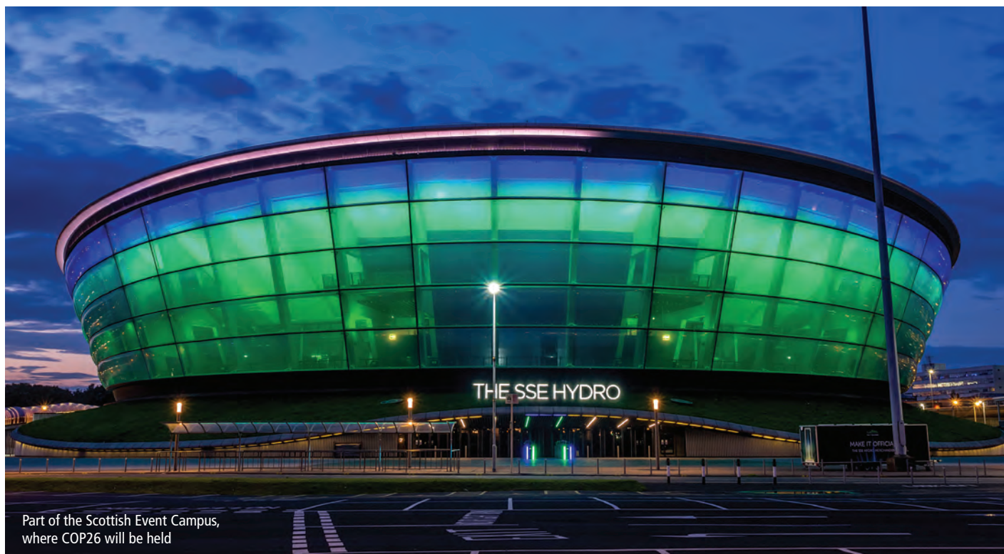
Part of the Scottish Event Campus, where COP26 will be held